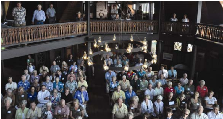
Picture: A large crowd gathers for the Lake George Association's 126 th Annual Meeting, held August 19 at the Lake George Club.

viewed on the LGA website at www.lakegeorgeassociation.org/events.asp .